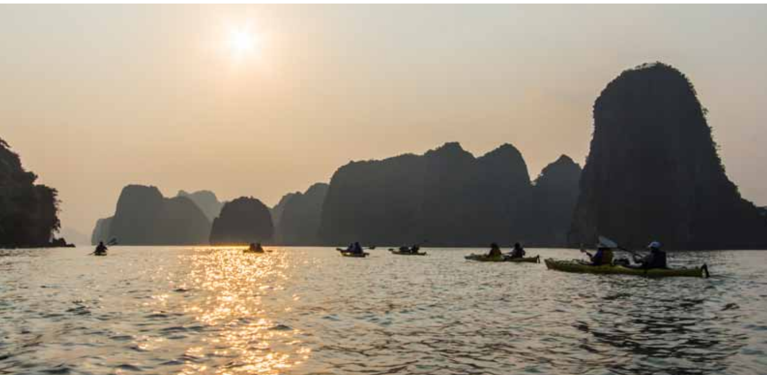
Returning to the Comforts of the Yacht After a Day of Kayaking Halong Bay

Discover Exotic Kayaking and Cuisine With the Leadership of Vietnam's Most Experienced Guides