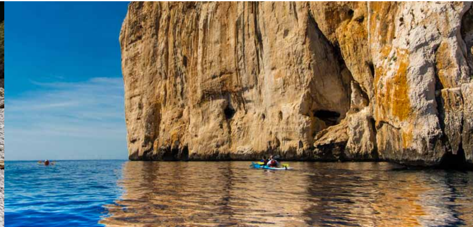
Early Morning Paddle Around Capo Caccia in Western Sardinia Near Alghero