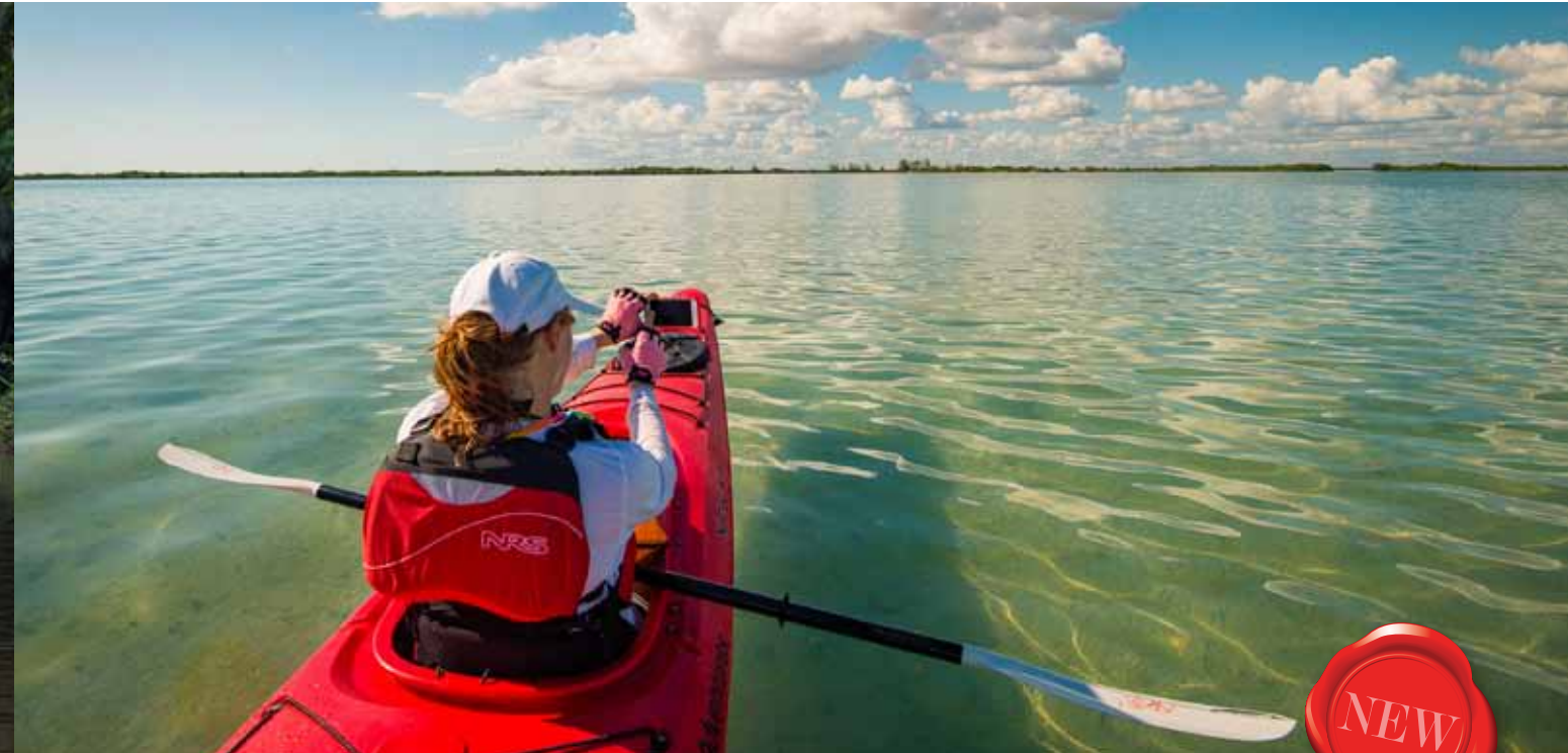
Kayaking Bahía Puerto Padre