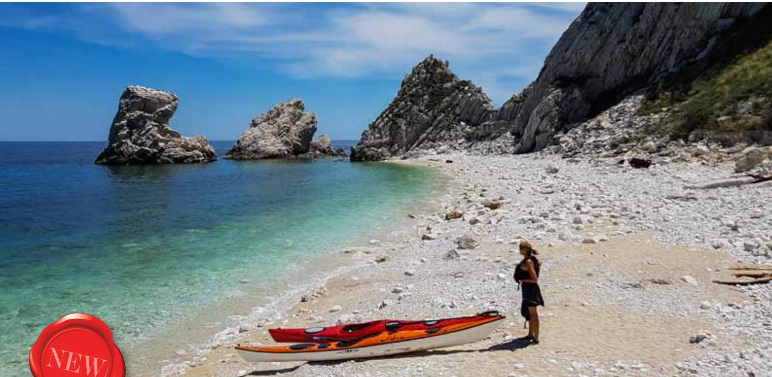
Taking a Break on the Adriatic Coast Near Ancona

Remarkable Paddling and Hiking on Europe's Last Great Wild Island