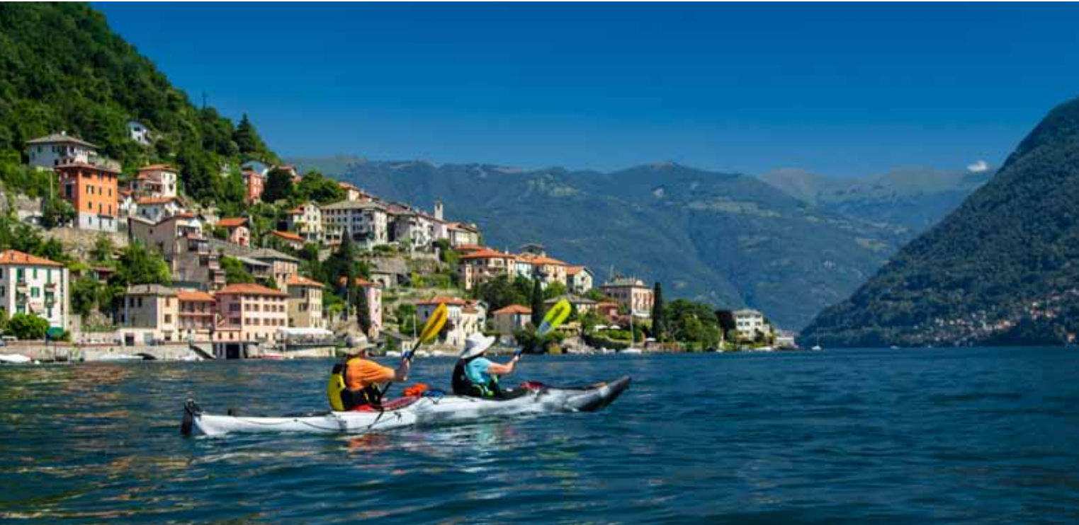
Crossing the Southern Leg of Lago Como

Our Exclusive Kayaking Adventure is the Most Unique Way To See the Lakes