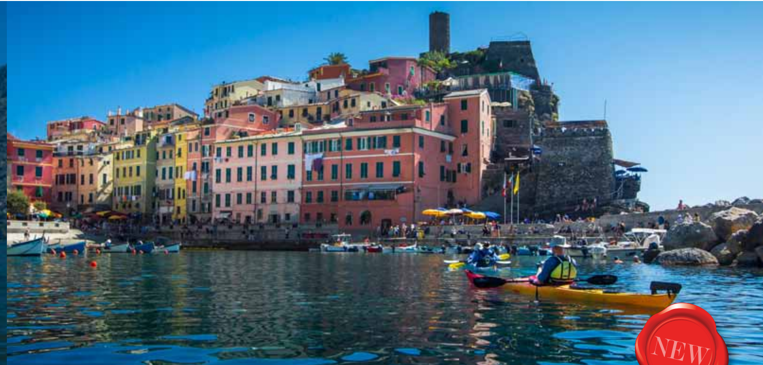
Kayaking into the Village of Vernazza, the Second of the Five Terre

Escape the Crowds and Discover the Very Best of Cinque Terre