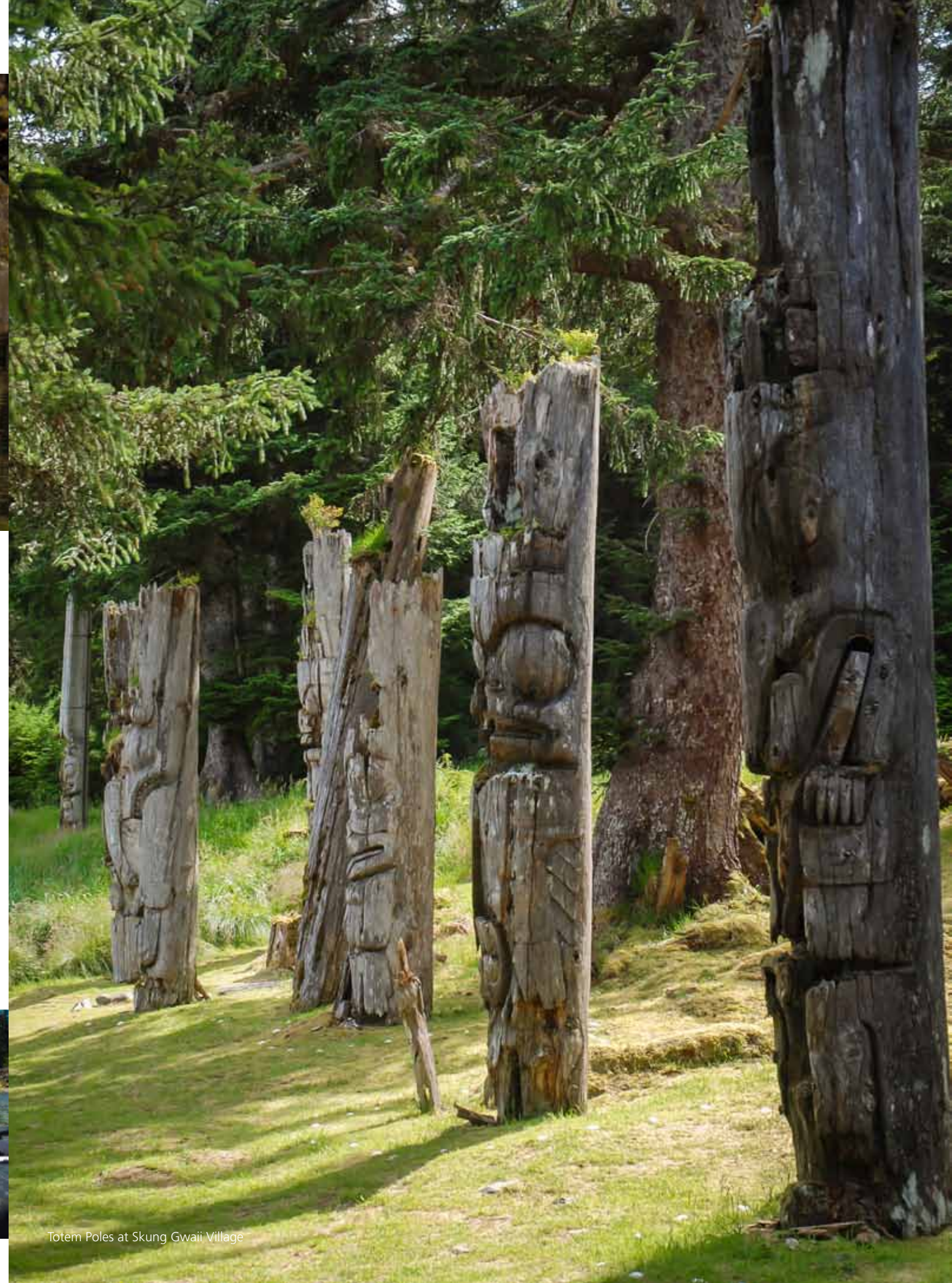
Totem Poles at Skung Gwaii Village