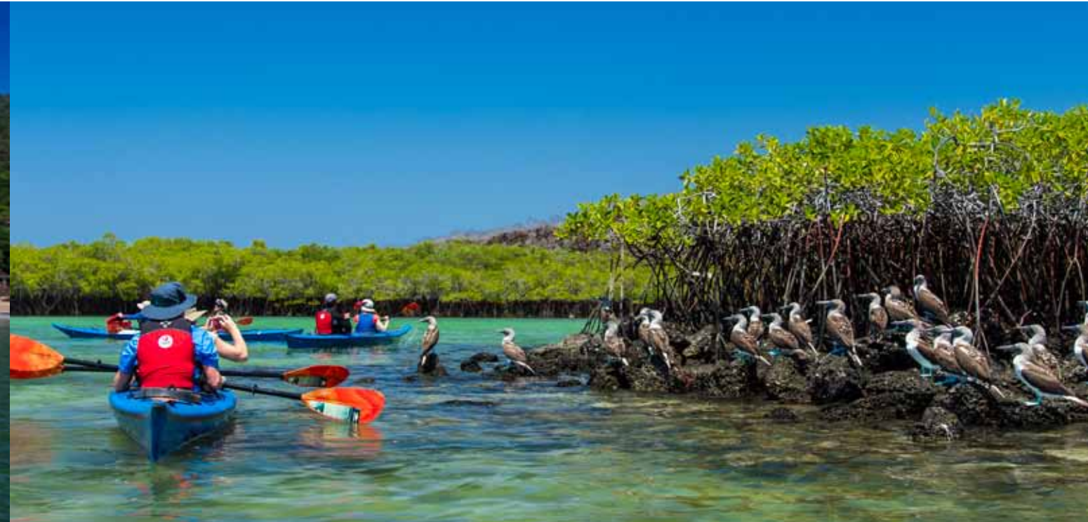
Blue Footed Boobies on the Coast of San Cristobal