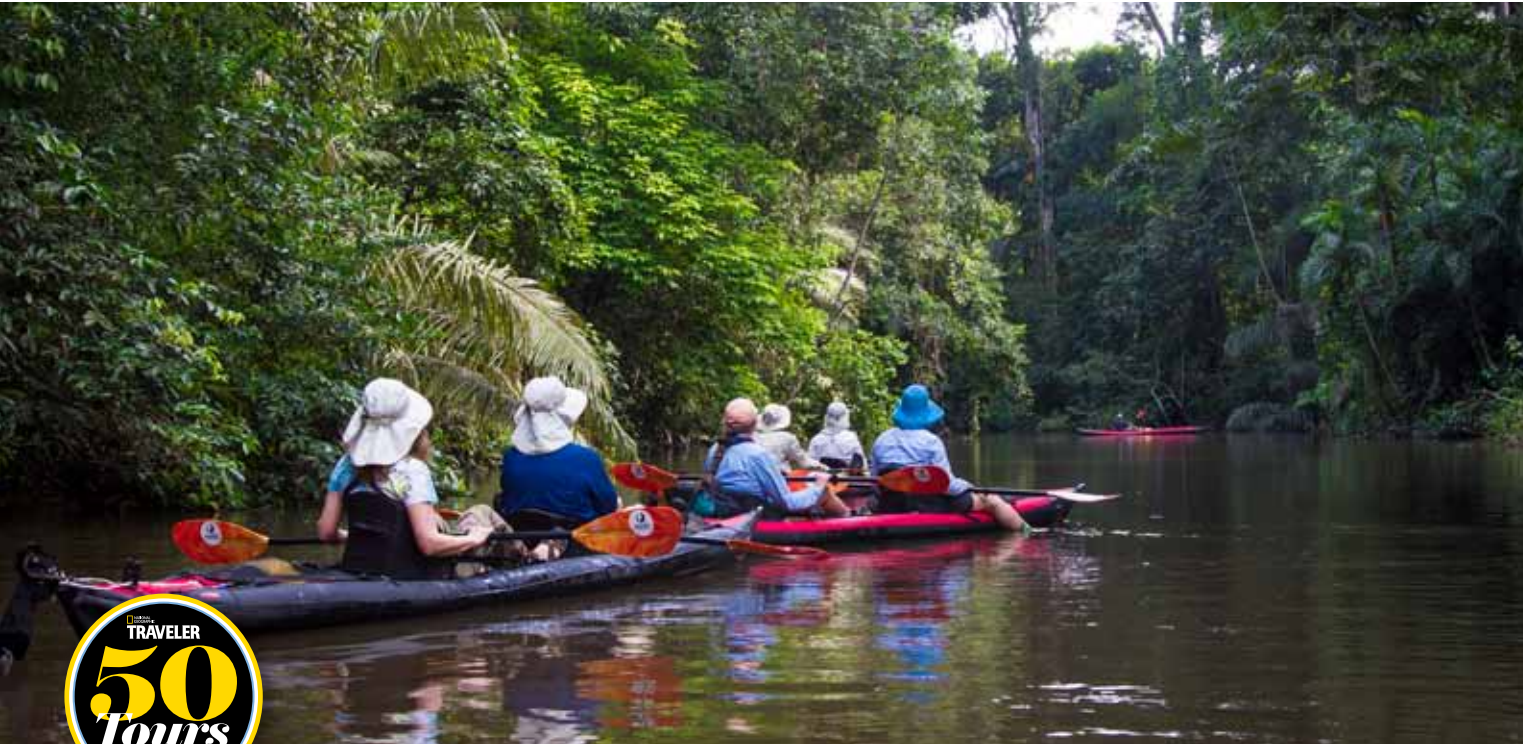
Drifting Down the Pañayacu River As the Naturalist Guide Spots a Troop of Monkeys

Explore Cuba Auténtica on the Wild East Coast