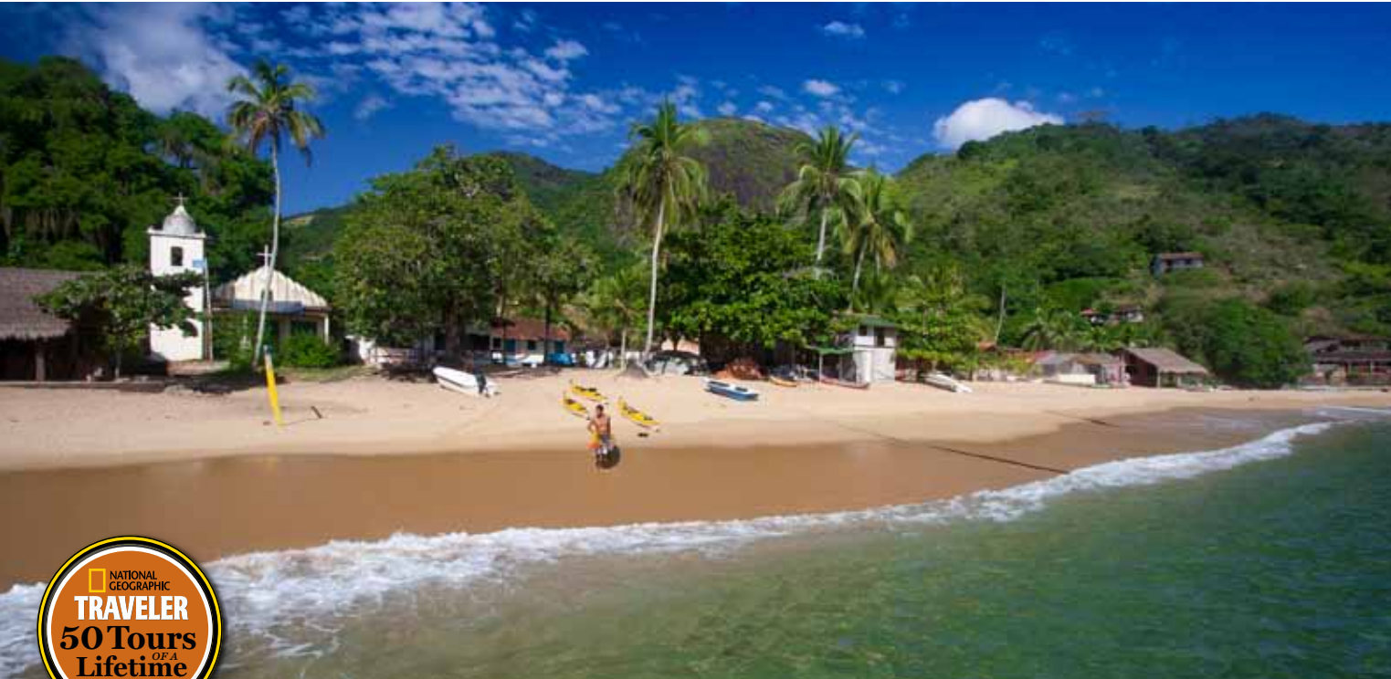
Getting Ready to Set Off From Idyllic Pouso da Cajaiba

A Multi-Island Journey that Combines World's Best Wildlife Viewing with Sea Kayaking, Snorkeling and Hiking