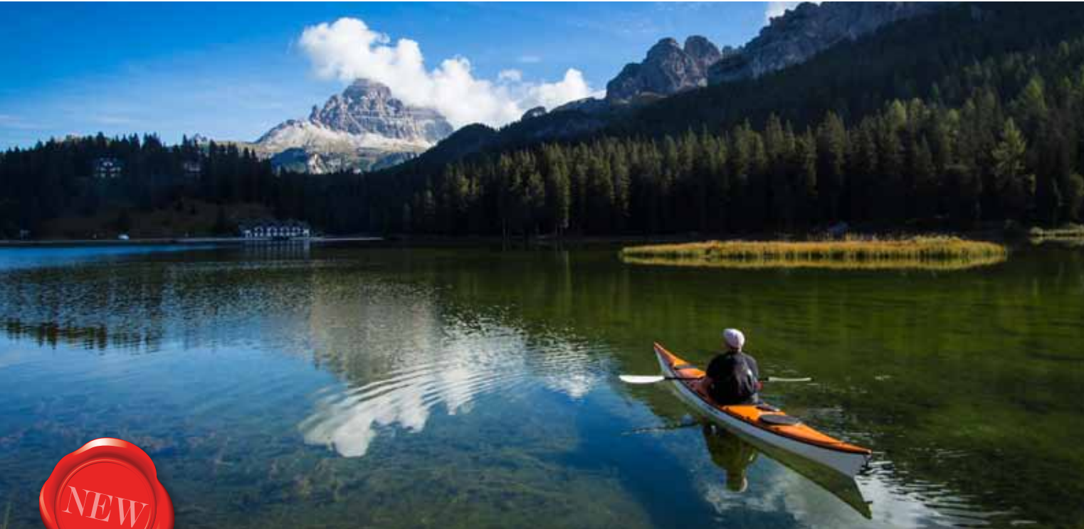
A Beautiful Day Paddle on Lago Misurina

An Exclusive Kayaking Odyssey to the Pristine Dolomites and into the Heart of Venice